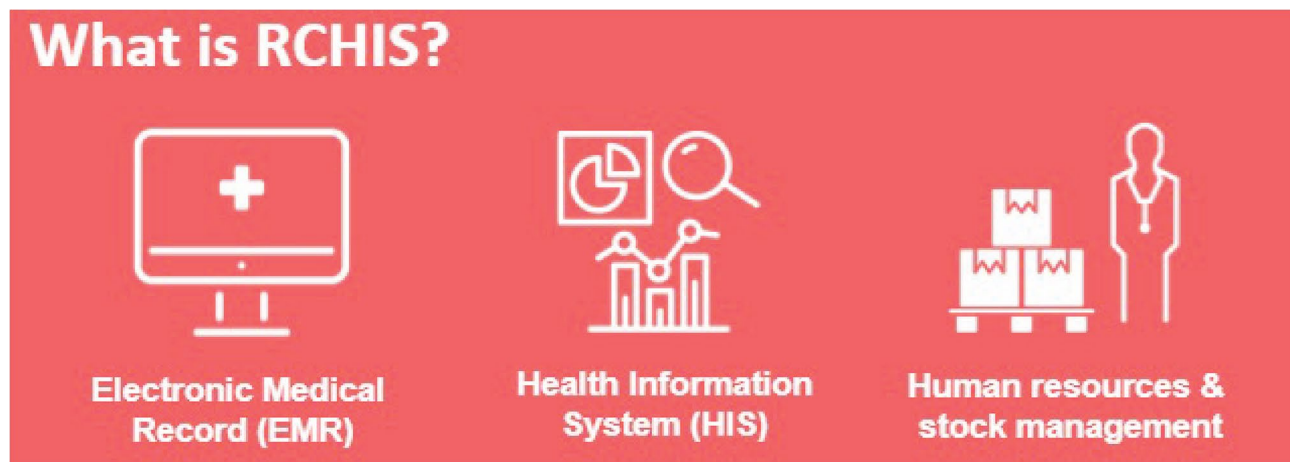
Fig. 1 Components of RCHIS

The development was done in an iterative process as a collaboration between IFRC Emergency Health team, IFRC IT department, RCRC national societies and an external software development company. A series of workshops were conducted to design the different modules of RCHIS, including bringing in expert advice from National Societies.